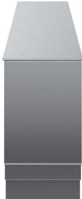
588693 (MB3ACOC000) Closed Base, 300mm